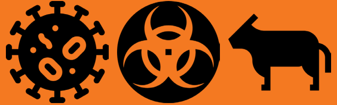
Bacteria and viruses